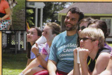
Building lasting friendships!