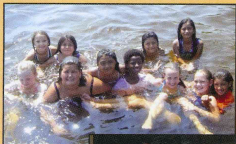
Swimming in Lake Waccamaw is the best!

Since 1957, thousands of boys and girls have experienced some of the happiest times of their lives while at the same time coming to know a new and special friend, Jesus Christ.