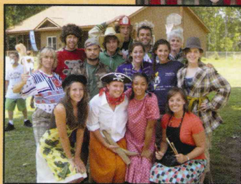
Fun skits by the hilarious counselors!